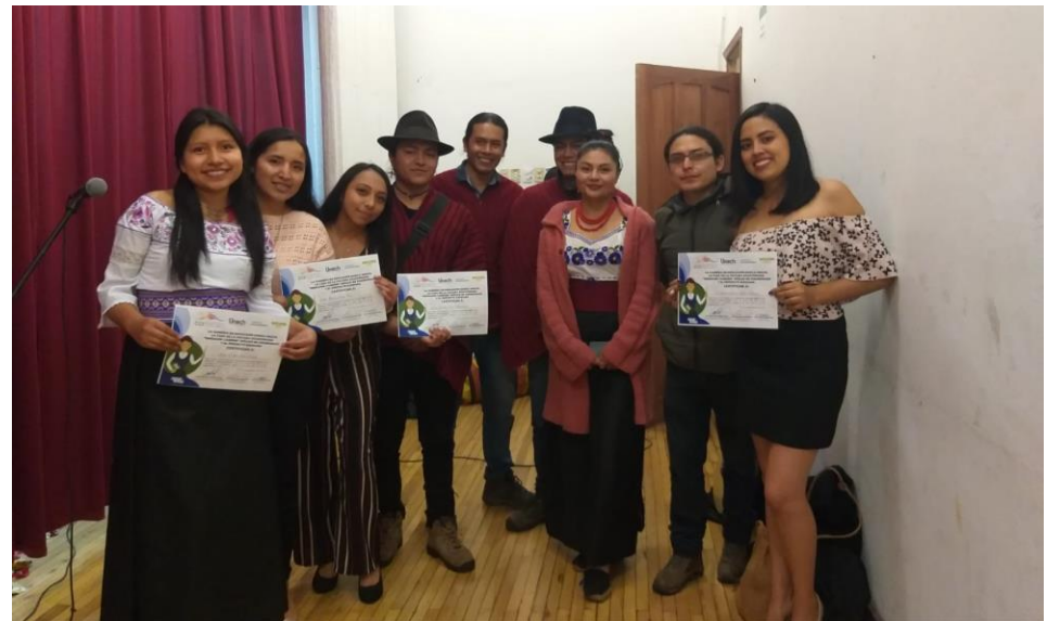
Presentation of certificates