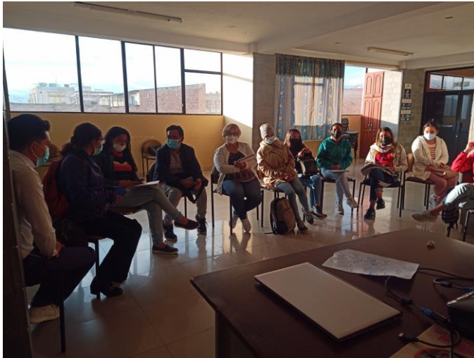
Participants in the class